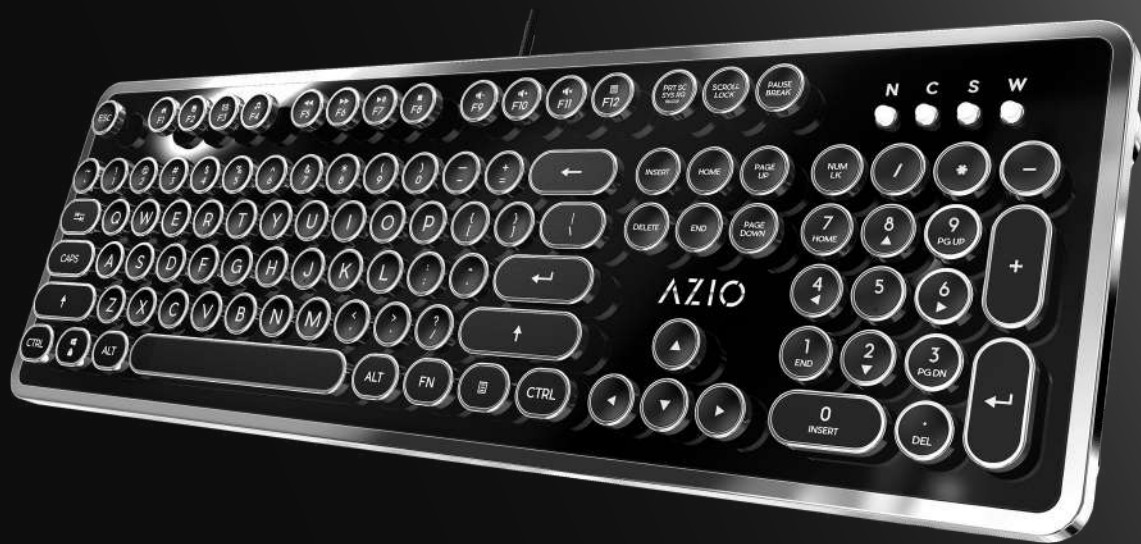
AZIO MK RETRO