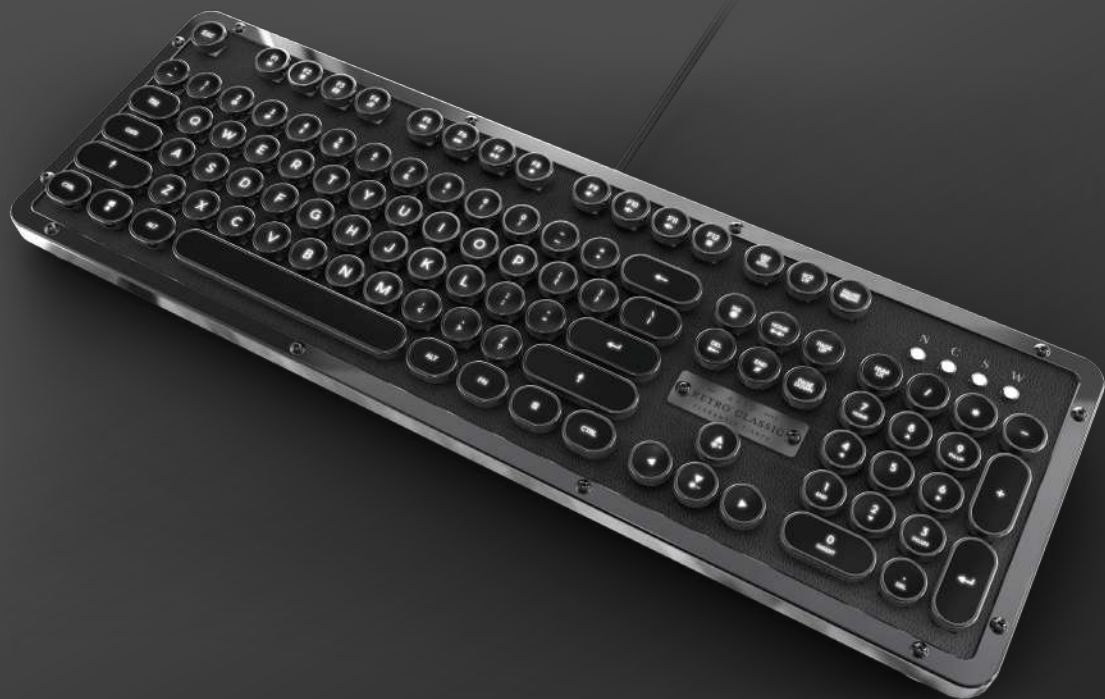
AZIO RETRO CLASSIC