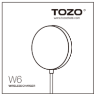
User Manual x 1