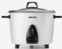
Pot-Style Rice Cookers