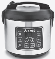
Multicookers/ Rice Cookers