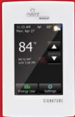
nVent NUHEAT Signature thermostat

Control your line voltage electrical heating system with nVent NUHEAT's premium range of controllers.