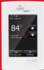
nVent NUHEAT Home thermostat