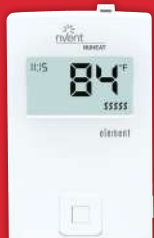
nVent NUHEAT Element thermostat

Our family of thermostats are designed exclusively by nVent NUHEAT to be easy to use and energy efficient, while fitting in with any modern home decor.