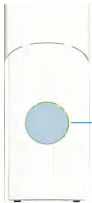
Button Battery CR2032