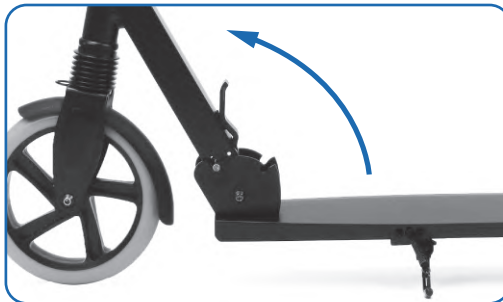
Unfold the scooter