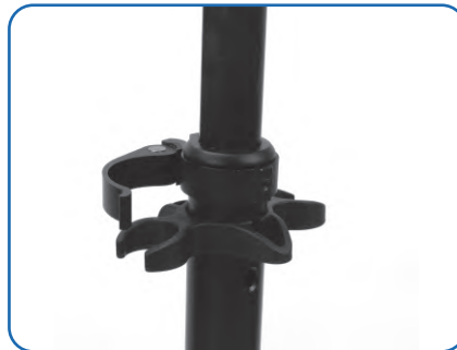
Adjust the height after unfolding the clamp, if the screws is loose, please tight it