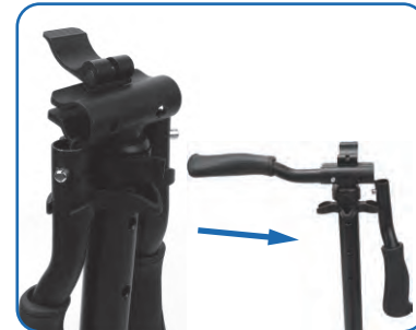
Assemble the handle bars