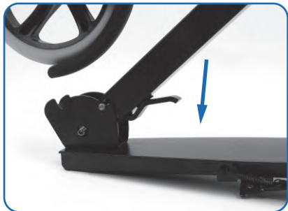
Step on the lever