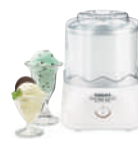
Ice Cream Makers

Cuisinart offers an extensive assortment of top quality products to make life in the kitchen easier than ever. Try some of our other countertop appliances and cookware, and Savor the Good Life®.