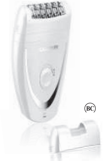
For your safety and continued enjoyment of this product ays read the instruction book carefully before using