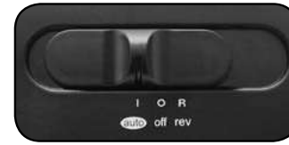
▲ Power switch in auto position

Use thick paper stock or greeting card to push the jam through ►