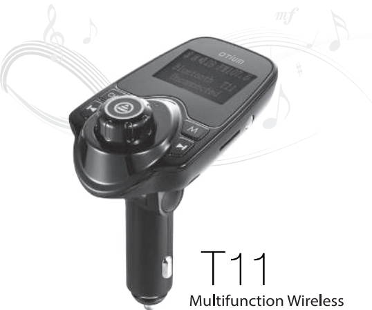
T11 Multifunction Wireless Car MP3 Player