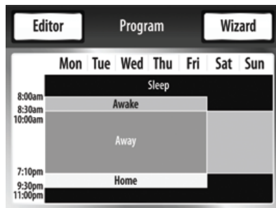
Program summary screen