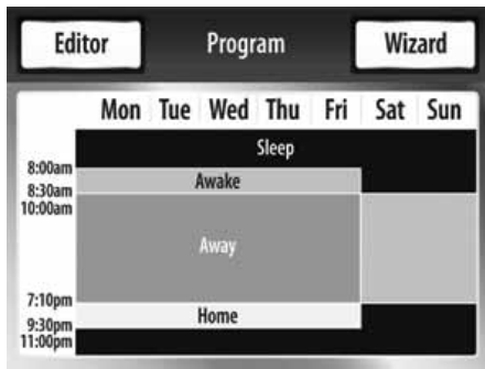
Program summary screen