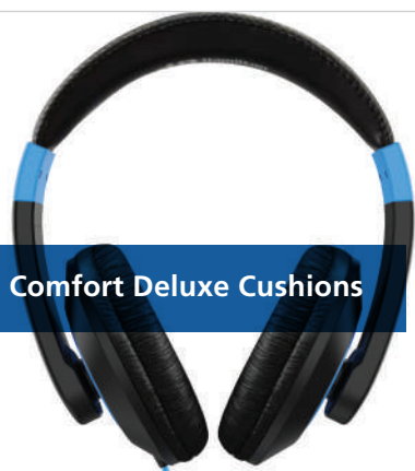
Comfort Deluxe Cushions