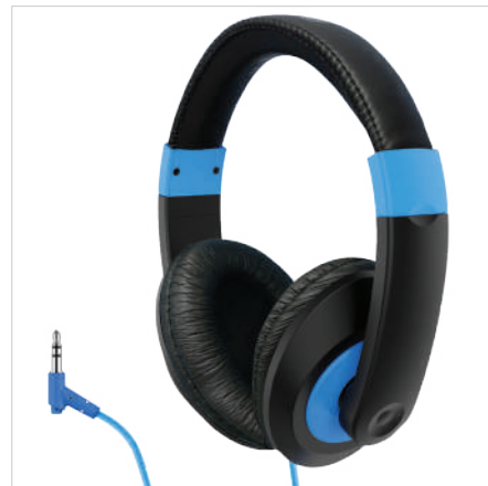
Smart-Trek™ with Blue Accents (ST1BL)

Product: 0.37 lbs., 7" x 5.25" x 3" Shipping: 0.65 lbs., 8.2" x 6.4" x 4.5" Warranty: 1 Year