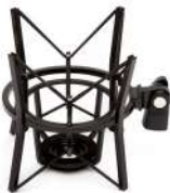
Shock mount (PSM1 - optional)