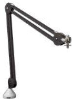
Studio arm (PSA1 - optional)