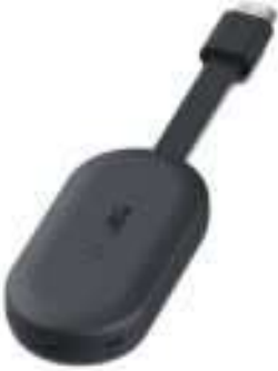
1. Front View